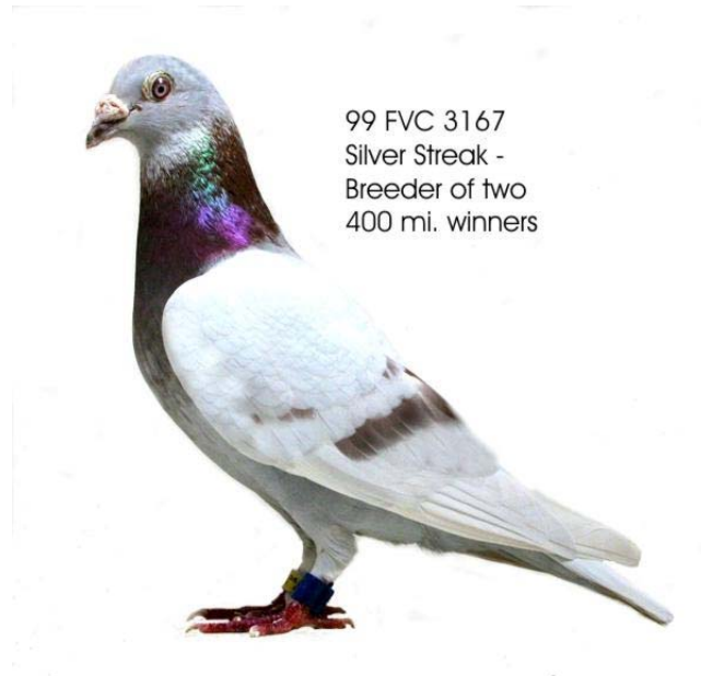
Silver Streak – A son of 611 and part of the Silver Line and Brother to the 2001 Snowbird Futurity Winner