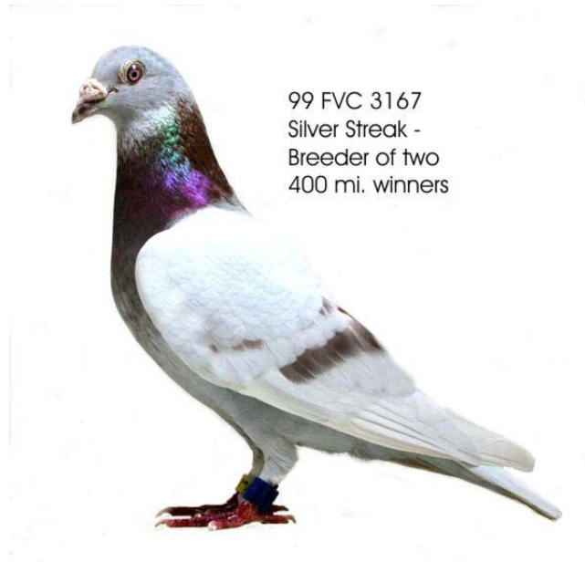
Silver Streak - Brother to the 2001 Snowbird Futurity Winner

Could you give us a little background about the Horemans family and the inbreeding that has gone into it?