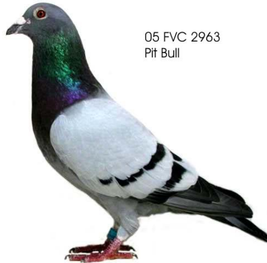
05 FVC 2963 Pit Bull

The Pit Bull – Inbred Grandson of Ed Lorenz's two greatest Racers, 1192 and 737 when mated to Dave Hunsicker's '93 Summer Classic Average Speed Winner 93 SYV 1207,