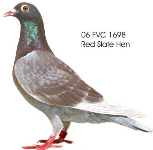
06 FVC 1698 Red Slate Hen