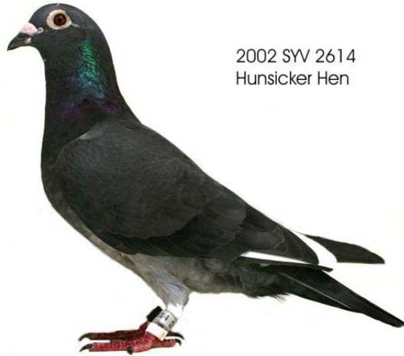
2002 SYV 2614 Hunsicker Hen

Black Spread Hen – A current outcross hen on loan from Dave Hunsicker