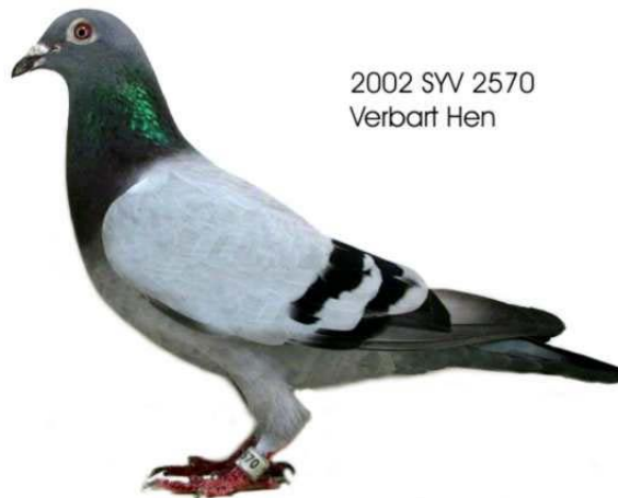
2002 SW 2570 Verbart Hen